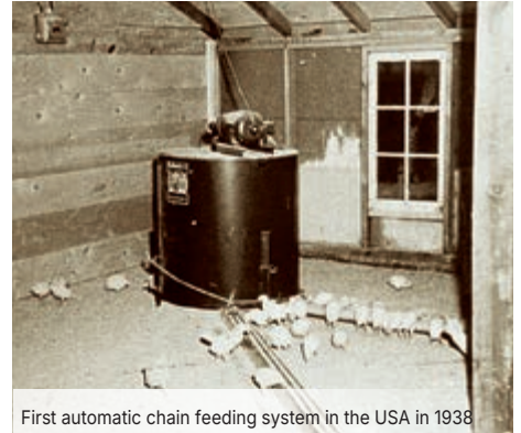
First automatic chain feeding system in the USA in 1938

entire system, however, is continuously under review and adapted to today's requirements for modern poultry production as necessary. The Big Dutchman feed chain CHAMPION can be used for any type of production, including breeders, pullets from their first day of life, and laying hens.