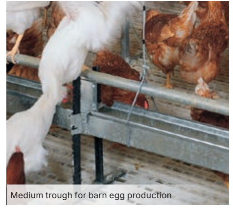
Medium trough for barn egg production