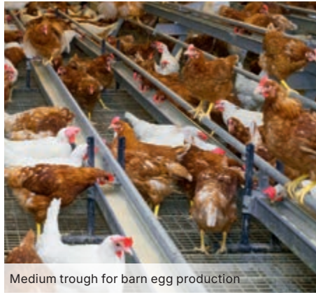
Medium trough for barn egg production