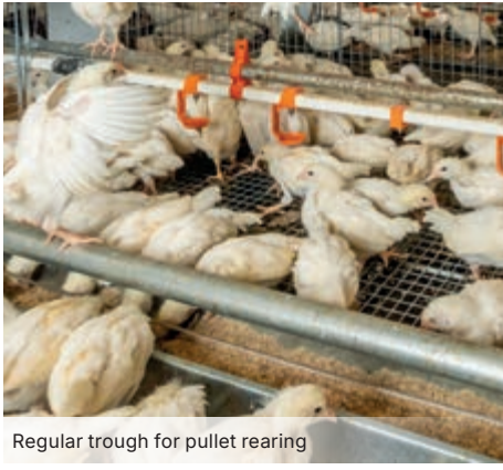
Regular trough for pullet rearing