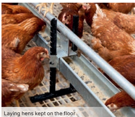
Laying hens kept on the floor