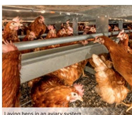
Laying hens in an aviary system