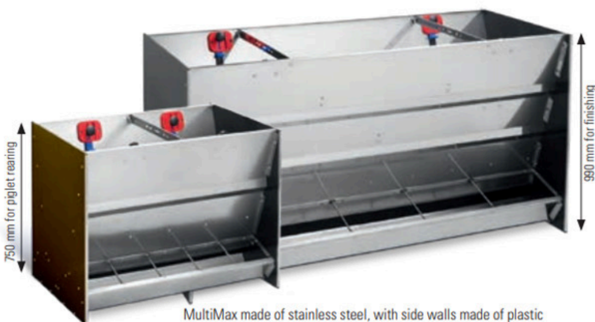
MultiMax made of stainless steel, with side walls made of plastic