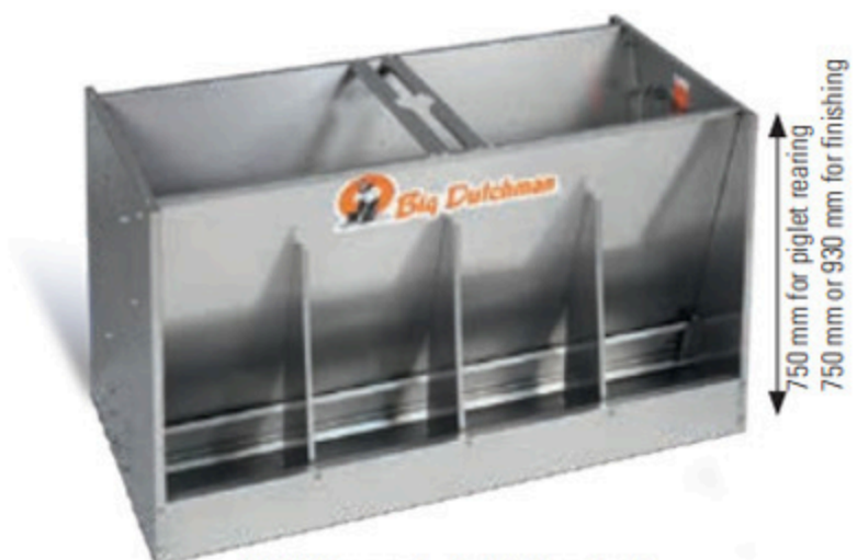
MultiMax made of stainless steel