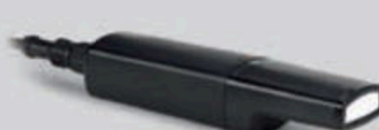
DOL 119 CO 2 sensor