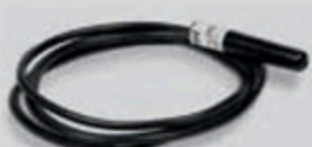
DOL 12 temperature sensor