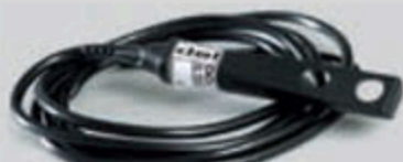
DOL 114 sensor for relative humidity